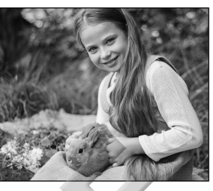
How does the girl feel about the rabbit? feel about broccoli?