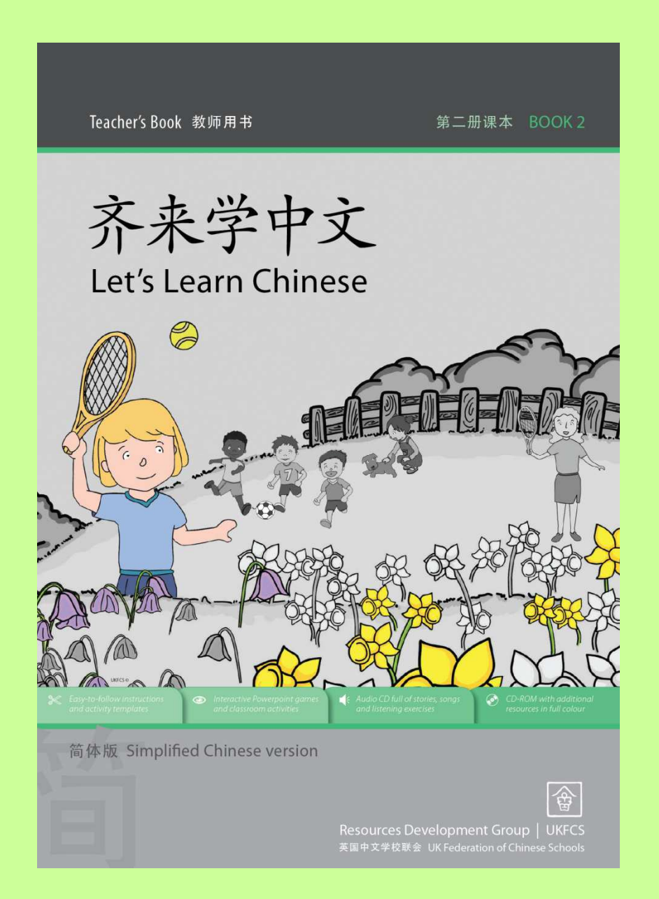
Teacher's Book (with CD-ROM) Traditional Script and Simplified Script in one volume