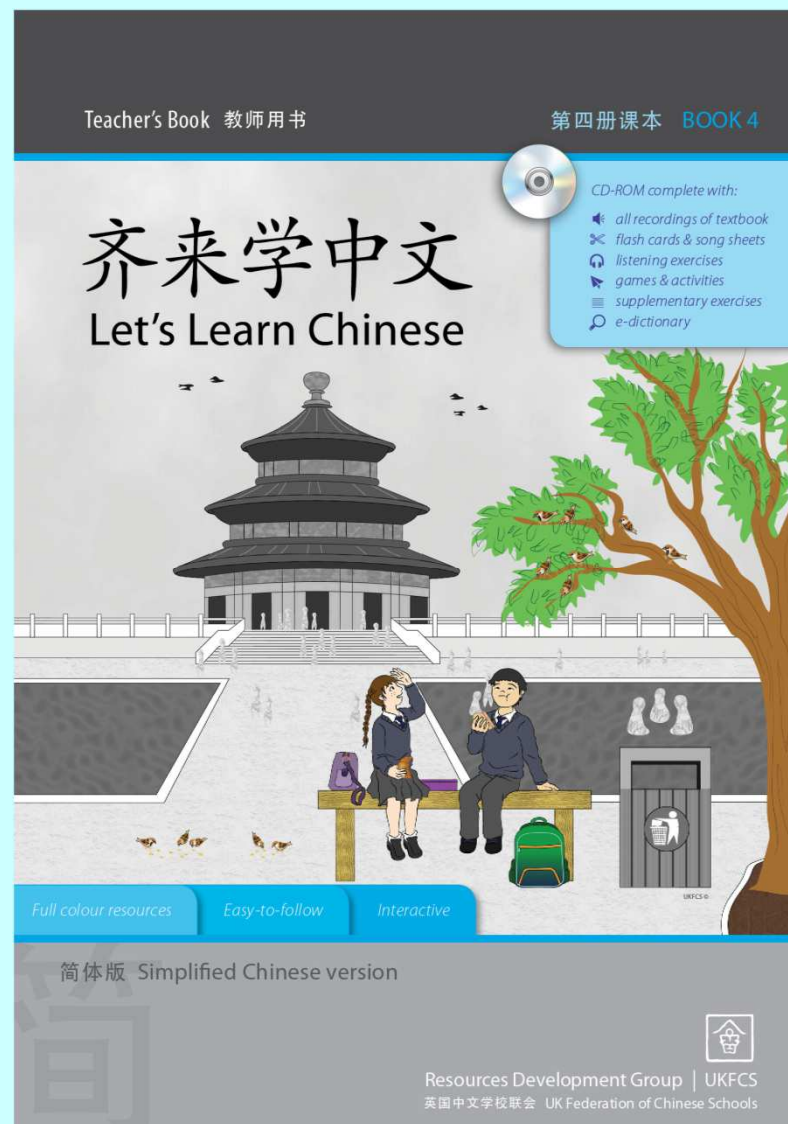
Teacher's Book (with CD-ROM) Traditional Script and Simplified Script in one volume